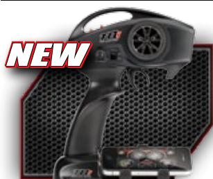
NEW TQi Transmitter With Docking Base ™

With such incredible speed and power comes a responsibility for precision control, and XO-1 delivers with the TQi and Docking Base, a breakthrough innovation that turns your iPhone ® or iPod touch ® into a powerful tuning tool. The full-color display combines with the Traxxas Link ™ App to deliver an intuitive, high-definition, graphical user interface that makes it simple to optimize your radio system for ultimate vehicle control.