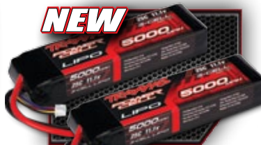
NEW Power Cell LiPo Batteries Included