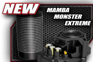
NEW MAMBA MONSTER EXTREME Traxxas/Castle Creations Big Block Brushless System