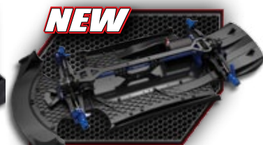
NEW Advanced Aerodynamics